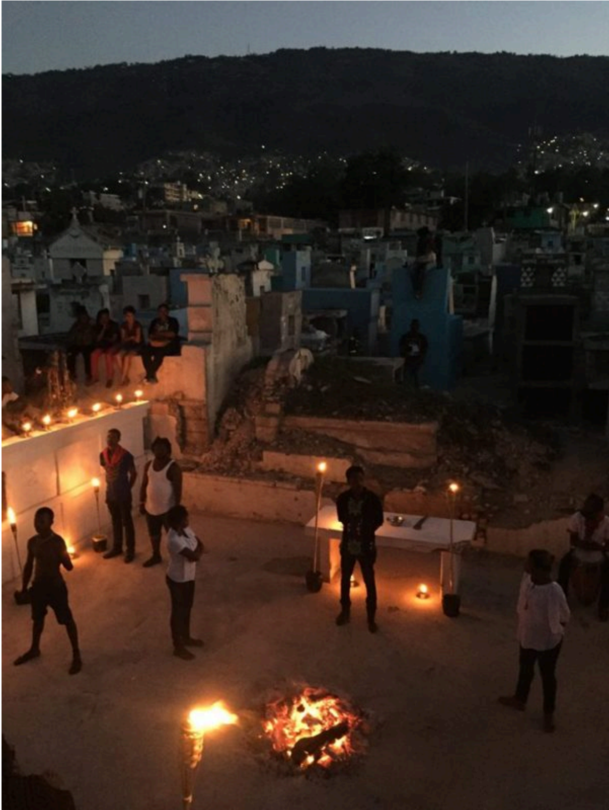
Performance views at the cemetery of Port-au-Prince – Haiti - 2017