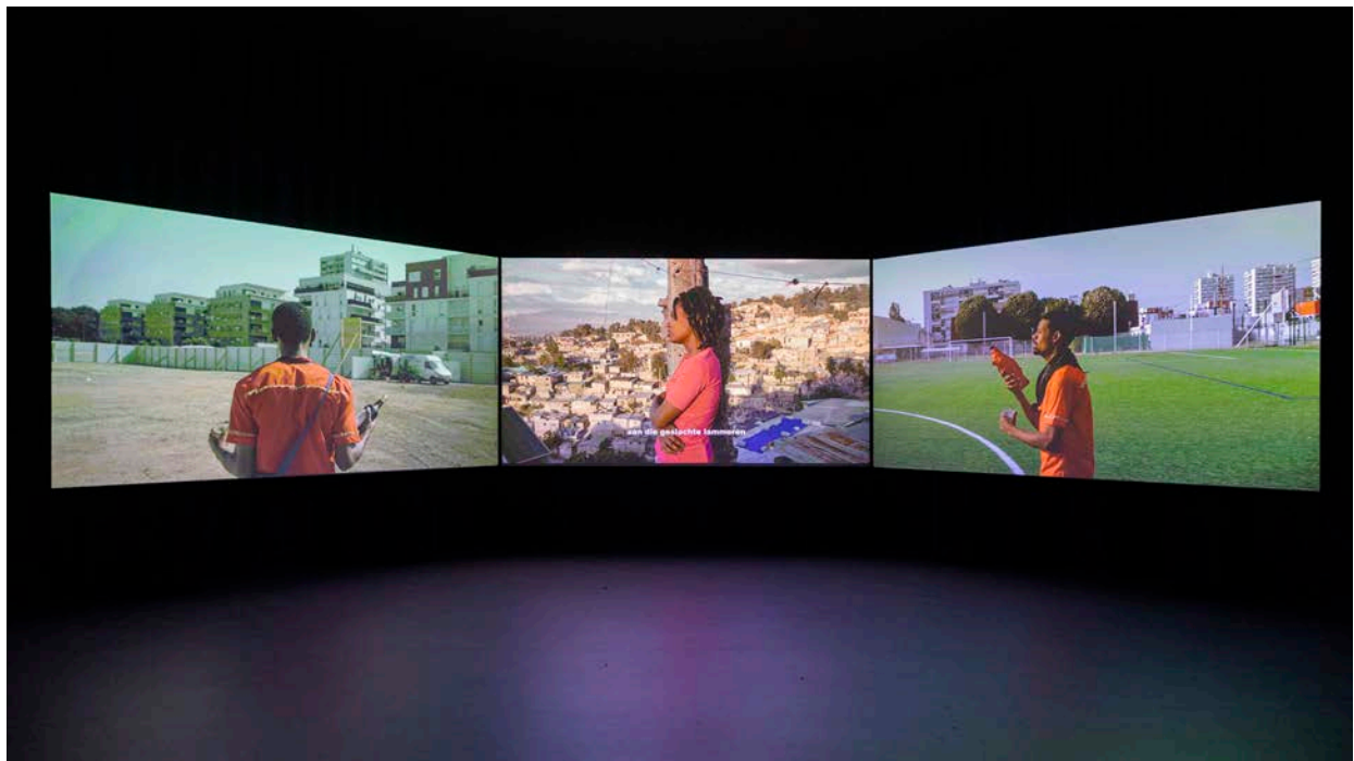
Installation views at Z 33 (Hasselt – Belgium) - 2022