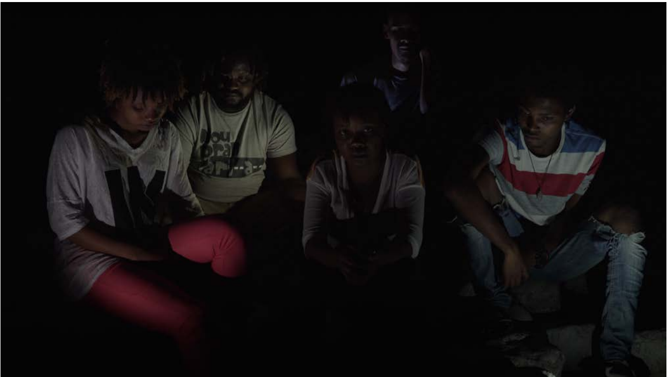
Stills from OUVERTURES - 2019