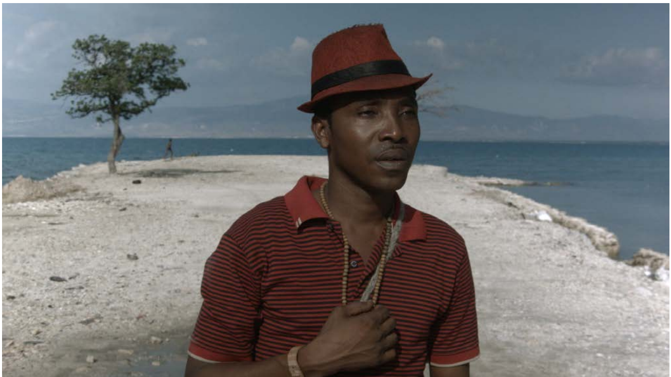
Stills from OUVERTURES - 2019