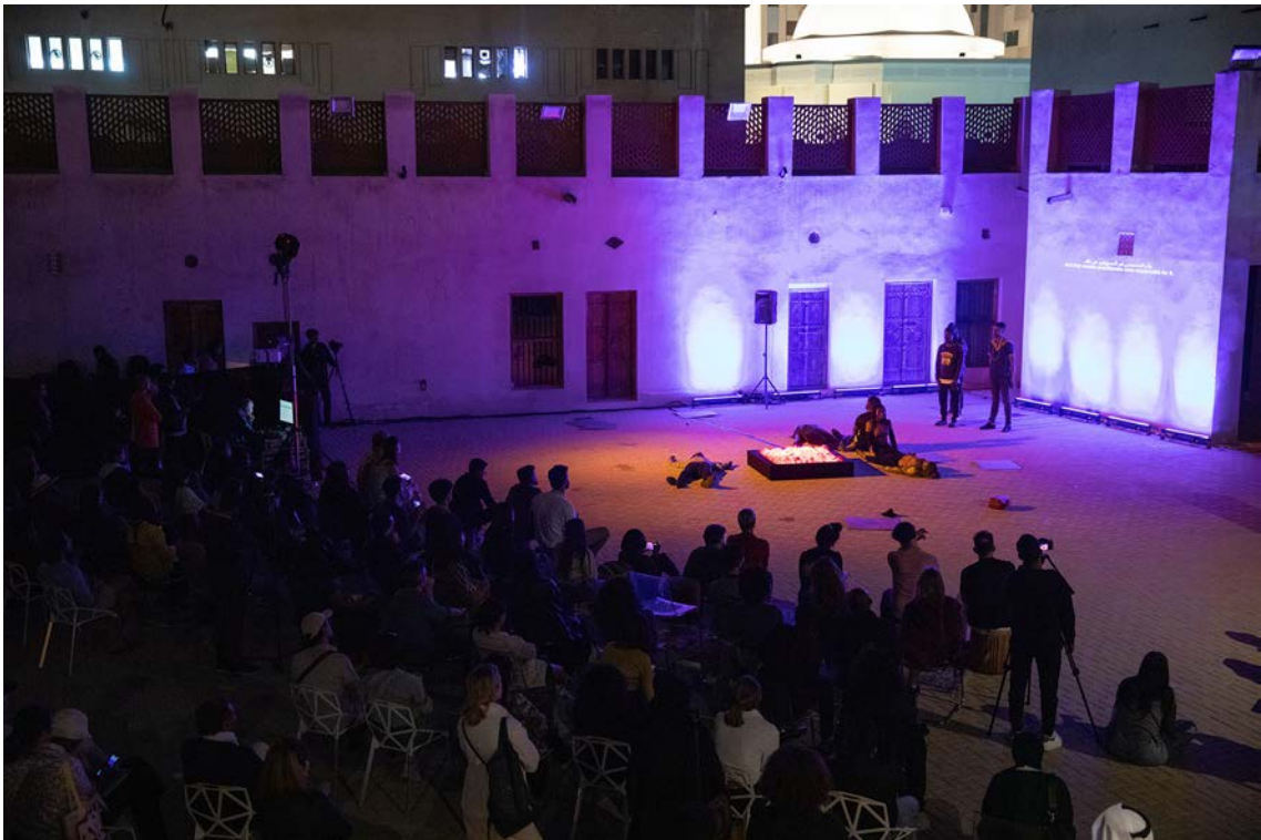
Performance views at Sharjah Biennial - 2023