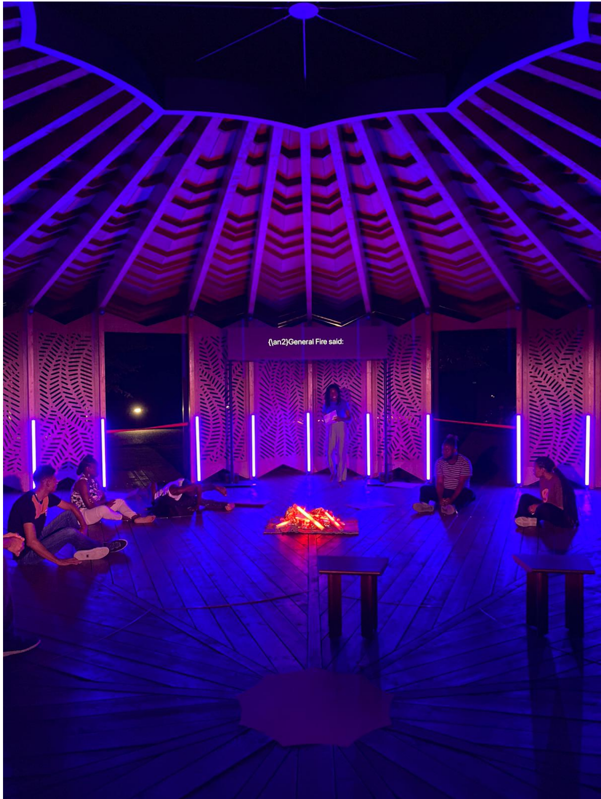
Performance view at Serpentine Galleries – London – August 2023