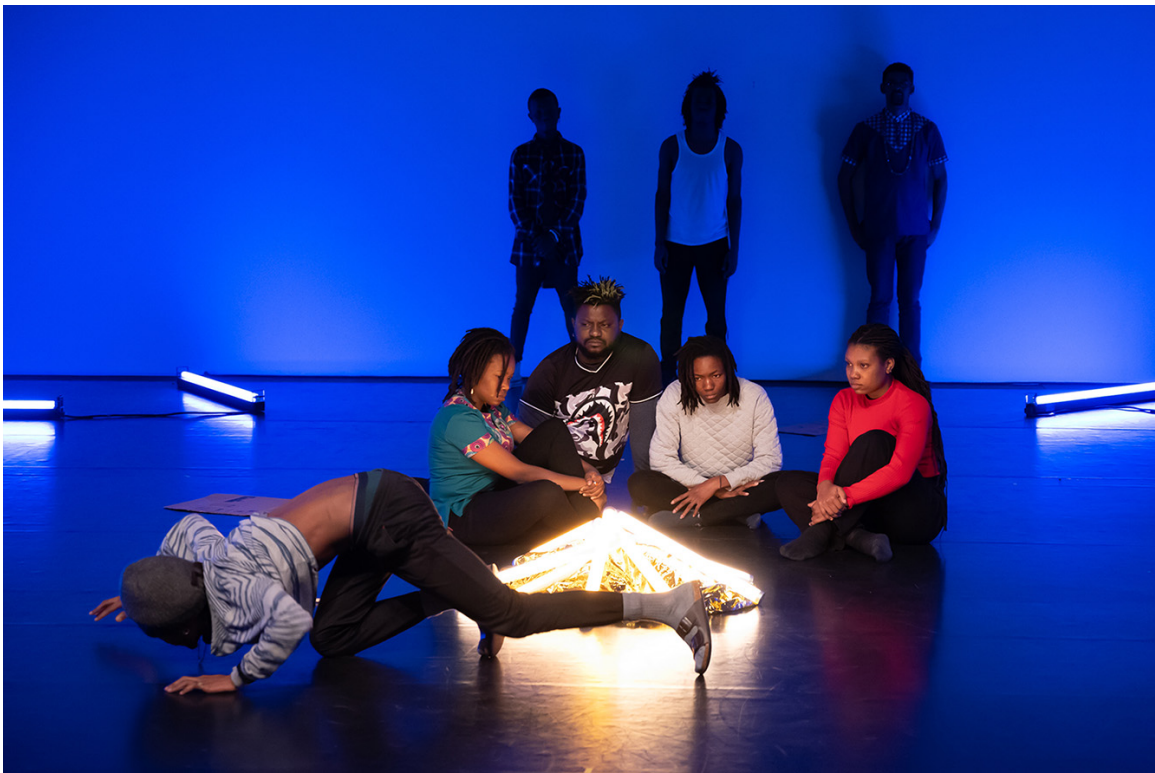
Performance views at DañisFabrik à Brest – France - February 2022