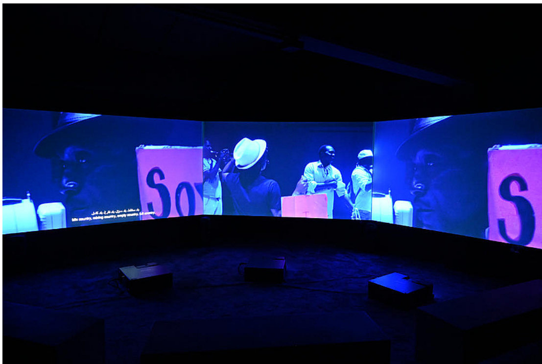
Installation views at Badischer Kunstverein (Karlsruhe) - 2022 and at Sharjah Biennale - 2023